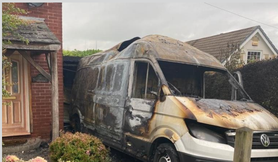
1. Van parked on customers driveway

Petrol is a dangerous substance; it is a highly flammable liquid and can give off vapour which can easily be set on fire and when not handled safely has the potential to cause a serious fire and/or explosion. This can be both applicable at work e.g. petrol generators and plant or in the home e.g. gardening equipment.