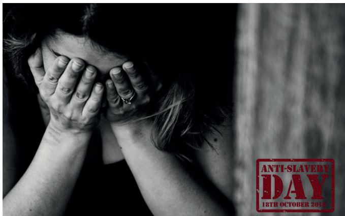
Anti-Slavery day promotion